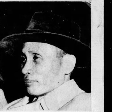
INDOCHINA'S VIETMINH leader, Foreign Minister Pham Van Dong, offers a grim profile through car windows as he leaves Geneva's Palace of Nations after a session on the Indochina situation.

By EDDIE GILMORE GENEVA (AP)—British Foreign Secretary Anthony Eden flew back to Geneva today for a final effort to break the east-west deadlocks on Indochina and Korea.