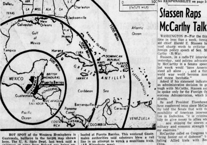
HOT SPOT of the Western Hemisphere is Guatemala, bulwark in the target map shown here. The U. S. State Dept. last week said a shipment of arms from Poland was being loaded at Puerto Barrios. This weekend Guatemalan authorities said saboteurs blew a rail line in an attempt to wreck a munitions train..

WASHINGTON (AP)—For the third time in less than a week, foreign and domestic news leaders have conferred twice since McCarthy's (R-Wis.)