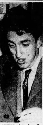
Author of the best-seller, "Cell 2455, Death Row," Caryl Chessman (above) has been granted a stay of execution by a California judge. The convicted kidnaper-sex pervert thus escaped death in the gas chamber for at least 60 to 90 days pending outcome of an appeal.