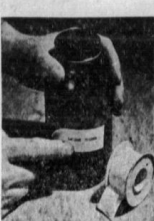
STABLE LABEL. You can make good labels that will stick to almost any surface from surgical adhesive tape. You can write on the tape with soft pencil or water-proof ink. Or, better still, stick it on typewriter roller and letter it.