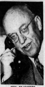
SEN. FLANDERS Saulted by Ike

WASHINGTON (AP) — President Eisenhower announced today he will go on television and radio to discuss the background of a Democratic move to boost personal income tax exemptions by $100 at an additional loss in revenue.