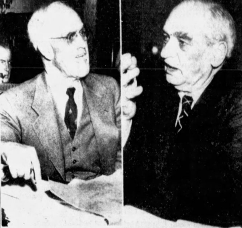
Chairman William Langer (right), North Dakota Republican, presided at a session of the Senate Judiciary Subcommittee and made public a summary of charges it has received against Earl Warren's nomination as Chief Justice.