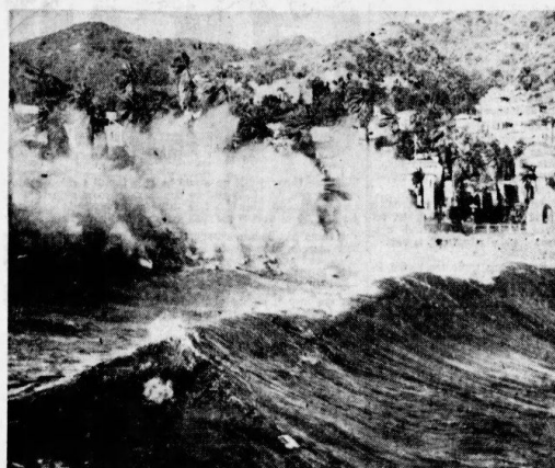
AT AVALON, CALIF., a hattering surf whipped up by winds of gale force, pounded the sea wall at the harbor. Barely visible in the water is wreckage of a 40-foot sailboat torn from its moorings and beaten against the wall..