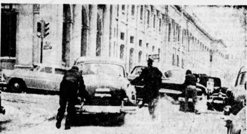
AT OKLAHOMA CITY, drought-stricken Oklahoma got rain and snow, and motorists unaccustomed to driving in moisture had a hard time getting to work. Employees ran as much as two hours late because of downtown traffic jams such as this.