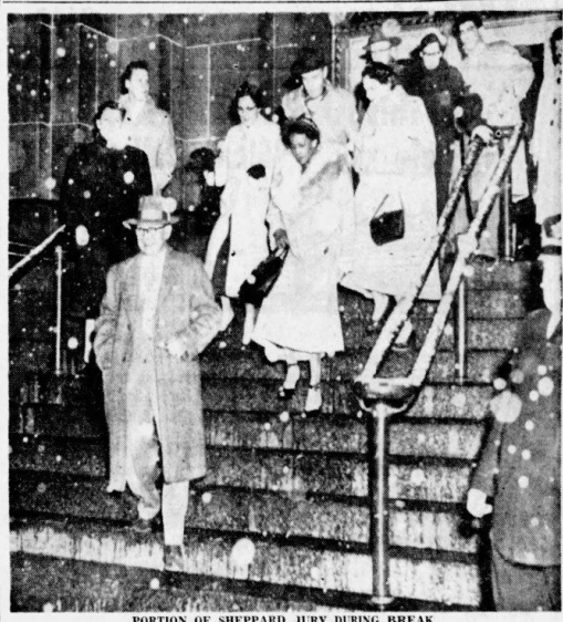
PORTION OF SHEPPARD JURY DURING BREAK Leaving Courthouse During A Snowfall.

PARIS (AP)—Premier Pierre Mendes-France told the French National Assembly today that the United States will contribute about 400 million dollars in 1955 to the economic and military buildup of South Viet Nam. Mendes-France said he would support him in a vote of confidence later on his Indochina policy, the Premier said that in his talks here last weekend with U. S. Secretary of State Dulles, he had ironed out many details of the two countries cooperation in the far eastern territory.