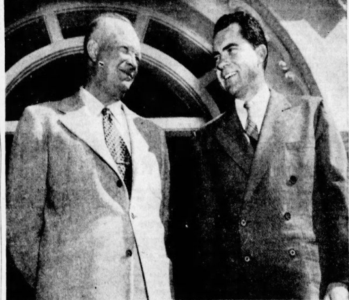
Ike And Nixon Discuss Campaign Plans.