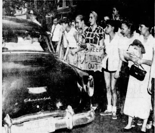
Police escort Negroes from Baltimore school.

Under the proposed amendment neither Mecklenburg nor Guilford would have had the third largest.