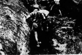
North Korean laborers use stretchers to carry a body from a ditch to a road where construction at Panmunjom. The road leads to Armistice Hall under construction in the background.

But today's tank-flight topped them all.