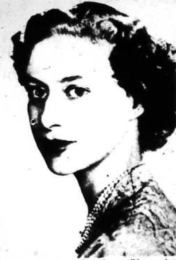
Princess Margaret, 22, right, of Britain may be free to wed Capt. Peter Townsend, 38, soon. The British government will introduce legislation to amend the Regency Act of 1937 which was...