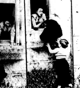
Center, the prince gives his sister a boost, while his mother gives a tug from above. At right, seeing the situation is in hand, the prince starts to climb through the window all by himself.

PHOENIXVILLE, Pa. (AP) — Twenty tired American GIs recently released by the Communists in Korea, arrived by plane at Valley Forge Military Hospital early today after a long secret-orchestrated journey from Tokyo.