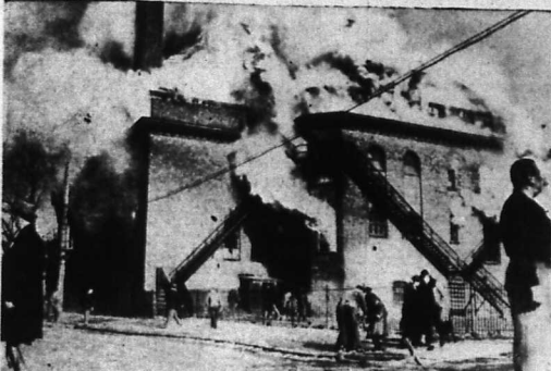
Firemen made a futile effort to quell this flash fire that destroyed an old public school building in Albany, N. Y., but the school was a total loss. Some 400 children were led to safety by the firemen.