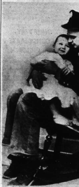
A 31-year-old Cleveland fireman proved this week that men in his business must be versatile when he quickly tackled a youngster...