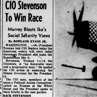
Heavy cargo nets are rolled and stretched across the flight deck. The nets trap the dangerous rockets as they sail across the deck, thus reducing the danger of an explosion. Crewmen are shown hurrying to get the rocket out of the way of other incoming planes. These pictures, from UP Photos, were made on the USS Badoeng Strait.