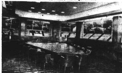
This is Col. Elliott White Springs' private office, with a directors' conference table raised from the floor.