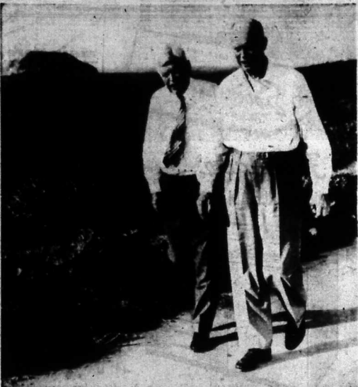
With famed Mt. Suribachi as a background, President-elect Dwight Eisenhower and Secretary of Defense-designate Charles E. Wilson tour the bloody battleground of World War II on two Iwo Jima during a stop on their Korean trip.