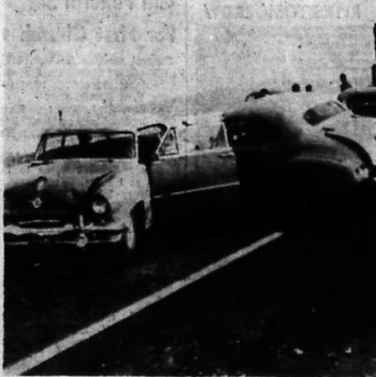
The New Jersey Turnpike, plagued by smog for the last two days, has been the scene of a series of spectacular chain-reaction traffic accidents in which three have been killed and more than 30 injured.