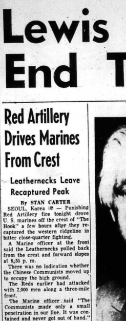
These two pictures are recent studies of John L. Lewis, chief of the United Mine Workers, and promised his co-operation in ending a nationwide soft coal strike.

United Appeal Begins Today Give Once But Generously For A Year