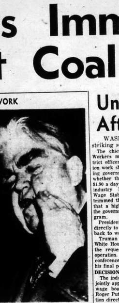
These two pictures are recent studies of John L. Lewis, chief of the United Mine Workers, and promised his co-operation in ending a nationwide soft coal strike.

BELGRADE, Yugoslavia —Belgrade radio says Bulgarian troops fired across the border at a Yugoslav pillbox yesterday and Bulgarian planes made three illegal flights over Yugoslav territory.