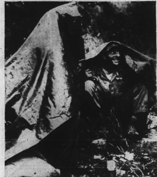
United States Marines on forward observation in North Korea huddle beneath their ponchos as the wet weather begins. The group directs artillery fire on Communist positions in the eastern sector of the battle front.