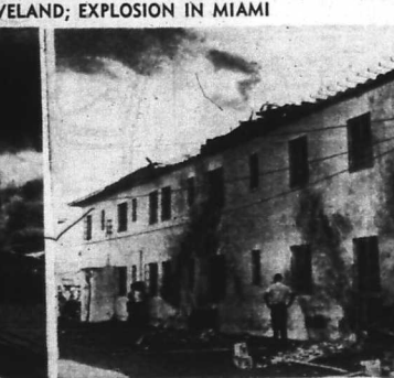
FIRE IN CLEVELAND; EXPLOSION IN MIAMI Firemen play water on a fire which wrecked a one-story garage in a congested area of Cleveland's east side business area. Flames shot several hundred feet into the air after some spilled gasoline exploded. Three firemen were injured. In Miami two violent dynamite explosions (right photo) smashed a new Negro apartment building tearing out windows, walls and doors. The apartment lies on the borderline between white and Negro sections in Northwest Miami.

U. S. EIGHTH ARMY HEADQUARTERS, KOREA — (AP) — Gen. James A. Van Fleet today said his Eighth Army has killed or wounded 58,000 Communist soldiers in Korea since Aug. 18 through Sept. 22. The report covered the entire 150-mile front. About 80 per cent of the Red losses were in the bloody "Battle of the Hills" in eastern Korea. The figure represents almost six Red divisions. Van Fleet said 2,800 Red were taken prisoner in the same period. The casualty totals of killed or wounded have been "evaluated." That is the Army's term for the final estimate after all field accounts and reports have been discounted for possible duplication or exaggeration. Since the Allies pushed off on limited offensives in eastern Korea they have captured enough material to equip nearly a full Red division, the Eighth Army said.