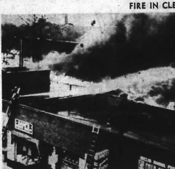
FIRE IN CLEVELAND; EXPLOSION IN MIAMI Firemen play water on a fire which wrecked a one-story garage in a congested area of Cleveland's east side business area. Flames shot several hundred feet into the air after some spilled gasoline exploded. Three firemen were injured. In Miami two violent dynamite explosions (right photo) smashed a new Negro apartment building tearing out windows, walls and doors. The apartment lies on the borderline between white and Negro sections in Northwest Miami.

Which is warmer, autumn or Spring? You might think they'd be about the same, coming midway between Summer and Winter. But in North America the autumn months — September, October and November — are warmer than the Spring months of March, April and May. That's largely because the ocean warms up and cools off more slowly than the land; in autumn, it's still warm; in Spring, it's still cold. That "retards" the seasons. Also, in autumn warm air masses are still being pushed southward from the Gulf of Mexico, while in Spring, cold air masses prevail, often bringing a return of Winter.