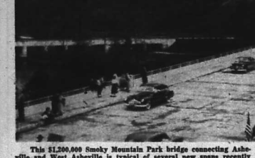
This $1,200,000 Smoky Mountain Park bridge connecting Asheville and West Asheville is typical of several new spans recently completed or under construction in North Carolina.

More than 8,000 miles of secondary roads have been paved under Governor Scott. This picture shows a crew at work in Harnett County.