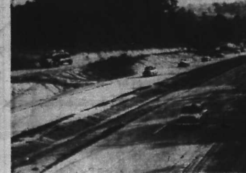
A new five-mile, dual-lane stretch of Highway 29 now enables through traffic to bypass the old town of Thomasville. The cost, $1,477,000. When complete, it will mean a grand total of 23,000 miles of hard-surfaced secondary roads already paved before Scott took office in January, 1949. It will mean a grand total of 23,000 miles of hard-surfaced secondary roads already paved before Scott took office in January, 1949.