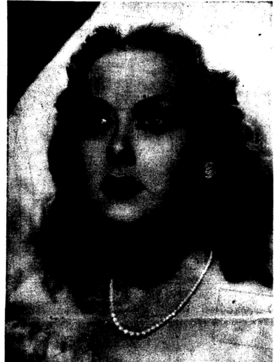
Adele Mara, Republic Studios star, will add a dash of glamour to the Carolinas Christmas Festival here Nov. 17. She will come here direct from Hollywood and will participate in all the Festival events.