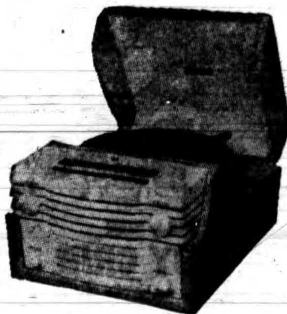
PHILCO MODEL 1253

1. Victrola 63E . . . The lowest priced Victrola there is! A natural for the children's room or den. It will play 10- or 12-inch records. A truly modern design complete with self-contained dynamic loud speaker. 29.95