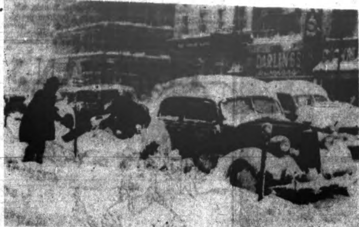
Erie, Pa., residents dig out after suffering the worst snowstorm since 1944. The snowfall, centered mostly within a 30-mile radius, started on Nov. 26 and has reached a depth of 31 inches. This scene is one of the main streets in the downtown business section.