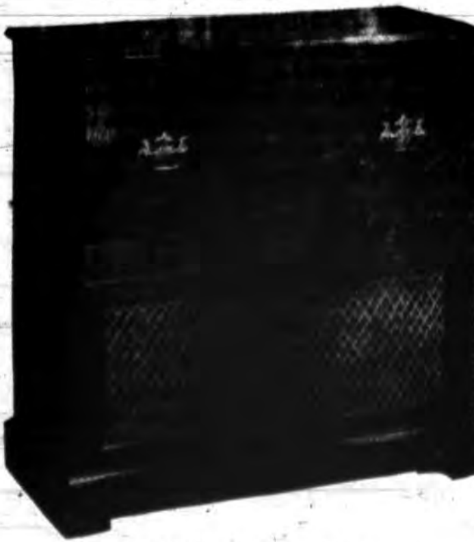
PHILCO MODEL 1270

6. RCA Victor Combination . . . radio and record player with handy record storage compartment. 10-tube set with RCA Victor's exclusive "Golden Throat" feature. An elegant gift for the family to enjoy for years. 325.00