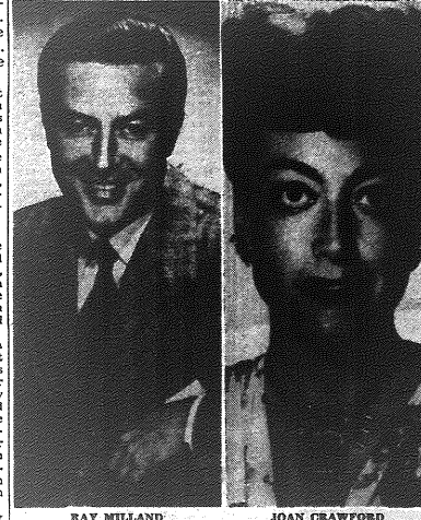
RAY MILLAND Best Actor in 1945 JOAN CRAWFORD Best Actress in 1945