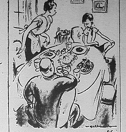
"Mother used to get me to eat mashed carrots by calling them golden oats—it would help if she thought up some pretty names for these funny messes we're getting now!"