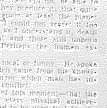
...you butchers will wish you had some friends after the war when we down-trodden common people arise...