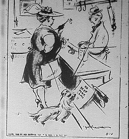
...you butchers will wish you had some friends after the war when we down-trodden common people arise...