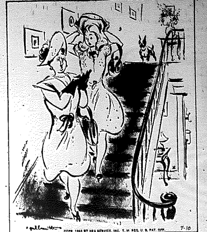
"Some of the women in the club like to loaf—if they start conversing how many war bonds they have, just say we've got them stacked all over the house!"