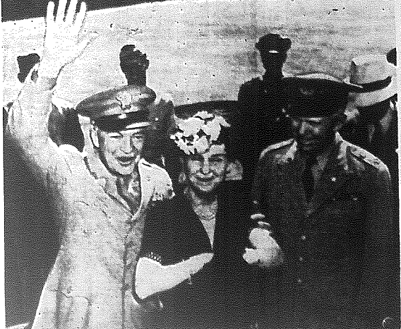
WELCOMB HOME—Arriving at the Washington National Airport General Dwight D. Eisenhower waves to the crowds gathered at the airport to welcome him...