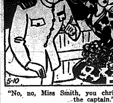
"No, no, Miss Smith, you christen the SHIP, not the captain."

(Continued from Page One) For special membership in the Army.