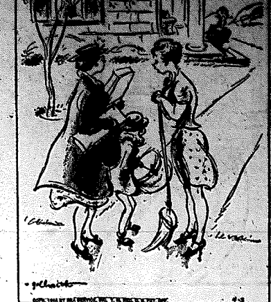
"Wilbur is so moody lately, since he wrote all those letters to the editor explaining Pacific strategy and General MacArthur crossed him up"