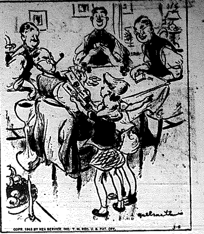
"Pop, you said you were out of cigarettes—what do we get for finding these cartons that were hidden down in the fruit-closet?"