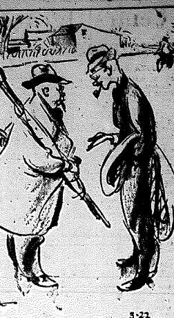
"Well, Judge, I see you've been buying garden tools again--looks like a busy Spring for the missus!"