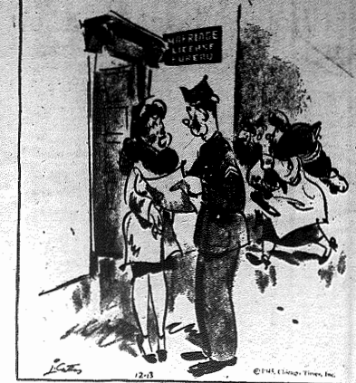
"Maybe you can get the G. I. Bill of Rights to pay for our wedding and honeymoon - after all, marriage is an education!"