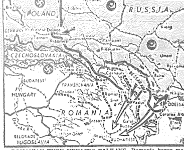
ROMANIAN TROOPS MENACE BALKANS—Romania has been marching against Hungary after its sudden exit from the Axis camp in an about-face that threatened the whole German position in the Balkans.

SUPREME HEADQUARTERS ALLIED EXPEDITIONARY FORCE—(AP)—Production of finished oil products for Germany was reduced an estimated 40 per cent by Allied air bombardments on June, June and July.