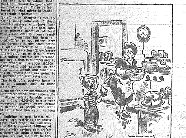
"But how could this spoil my dinner, Mom? We won't!"