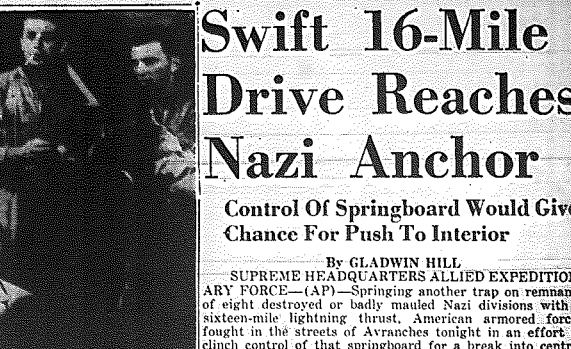
On the left flank the Americans also captured the obstacle city of Torigni-Sur-Vire, 27 miles inland, after threatening its isolation by taking the hamlets of La Reaiviere and La Frechtere to the southeast; front line dispatches reported.

Mostly cloudy and moderately hot this afternoon, tonight and tomorrow, with scattered showers and thunderstorms in the afternoon or evening.