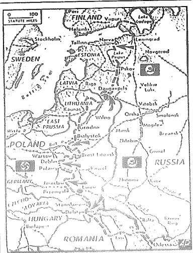
RUSSIAN MARCH ON—Red Army took Phenyl and Jerslow today as their forces took up triumph after triumph over the Germans.