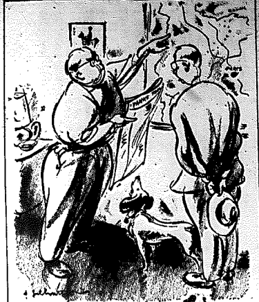
ONE 'HUNT' BY THE BOY IN THE UNIFORM...