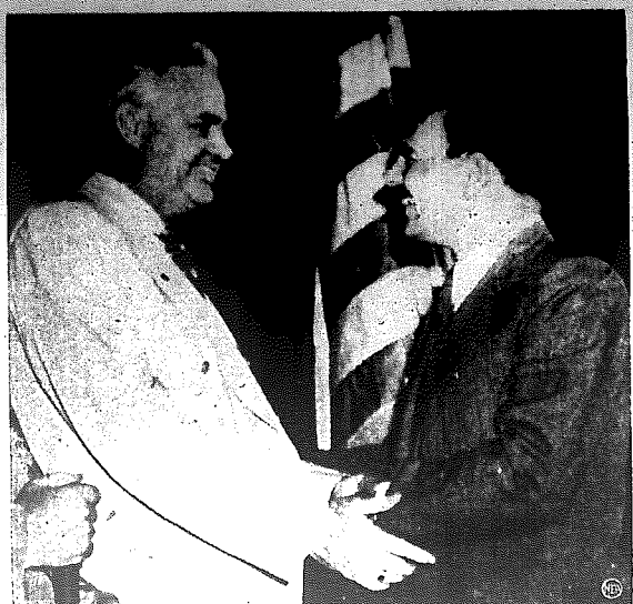
GOP TEAM: DEWEY AND BRICKER—The Republican Party's candidates for President and Vice-President of the United States—Governor Thomas E. Dewey of New York and John W. Bricker of Ohio—are shown together in the convention hall at Chicago.

ADVANCED ALLIED HEAD-QUARTERS, New Guinea—(AP)—A trap, already narrowed to 150 miles, was compressed today on thousands of Japanese at Wewak, British New Guinea. The capture of 80 jungle coast miles in 28 days by Australians who are within 70 miles of Wewak on the east was disclosed by Gen. Douglas MacArthur. Americans have been approximately 80 miles from it on the west, since Wewak was bypassed in the April 23 invasion of Milne Bay. There is 80 miles between Wewak and Milne Bay, but Yank patrols since have pushed back east toward Wewak for at least ten miles. These thousands of imprisoned Japanese have been left behind by additional leapfrog operations which have carried MacArthur to Blak Island in the Schoutens off North Dutch New Guinea. Blak is more than 400 miles northwest of Wewak. The Aussies approaching Wewak from the east have crossed the mouth of the Sepik River. In their 80-mile march from Buna Harbor, they overran the Japanese strategic supply depot of House Bay, capturing ammunition, food, trucks and fuel. The Japanese retreated steadily toward Wewak and offered the Aussies only token opposition. How many thousands of the enemy are trapped at Wewak is not definitely known. At the time Milne and Hollandia in Dutch New Guinea, were invaded, the number of Japanese bypassed was estimated at 60,000.