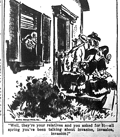
"Well, they're your relatives and you asked for it—all spring you've been talking about invasion, invasion!"