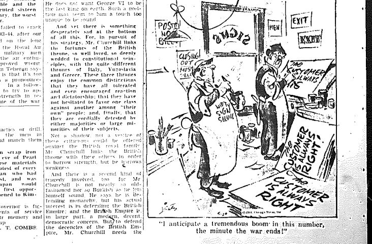
"I anticipate a tremendous boom in this number, the minute the war ends!"