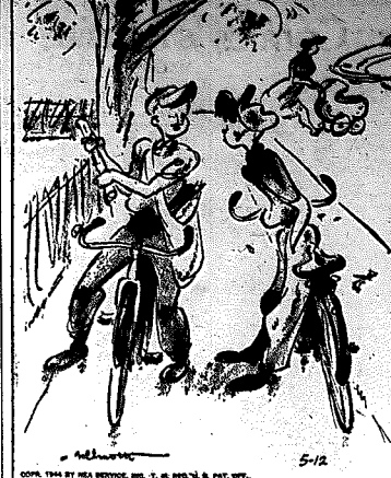
"We got a letter from Dad, and he's been promoted to sergeant—guess they're thrashing around with those Germans!"