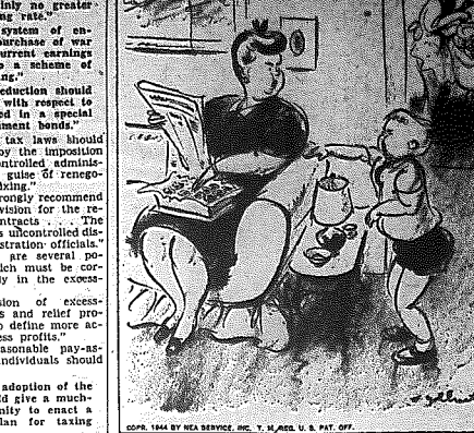
"You're just like your father—you think of no one but yourself!"