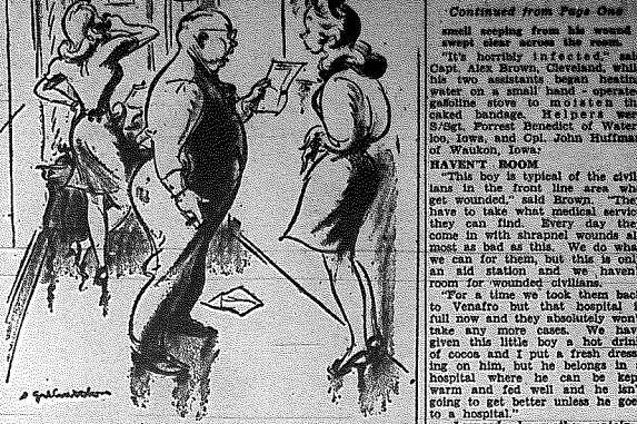
Just take a look at this phone bill. Are you girls trying to be popular with the whole Army?