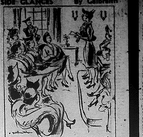
"Now the first thing we must do to make our charity auction a success is spread a report of scarcity—make the people think there may be really nothing to buy!"