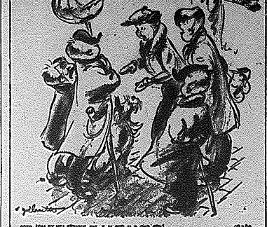
"Oh, gosh, let's cancel our plans for the usual wrecking—help's so scarce we might have to make the repairs ourselves!"

"I don't know. I just work here," he told them when they wanted to know what American forces were then attacking. Disgusted, they dispatched him toward their rear lines. But here he caught their eye and then themselves.