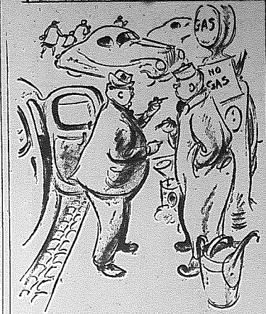
COM. 1544 OF THE SERVICE, INC. THE REG. U. S. PAT. 277

"I remember the day when you wiped my windshield and gave me a car a dry cleaning just to sell me three gallons—and by Jimmy, that day's coming again!"