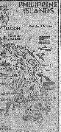
PHILIPPINE ISLANDS. ACTION IN PHILIPPINE WATERS—Japanese efforts to cut off their troops in American-invaded Leyte Island have resulted in a big three-pronged naval-air engagement.

LONDON—(AP)—The Russian Army has crossed the frontier into Norway, Marshal Stalin announced tonight. The order of the day broadcast by Moscow said Gen. K. I. Meretskov's Arctic Army which crossed the frontier had already captured the Norwegian seaport of Kirkenes.