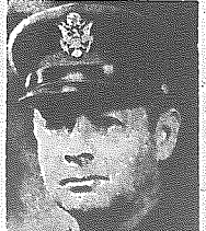
KEY EXPERT — Recently decorated for his part in developing jet-propelled aircraft, Brig. Gen. Benjamin M. Childers, now heads the U. S. 12th Air Force Fighter Command operating in the Mediterranean theater.